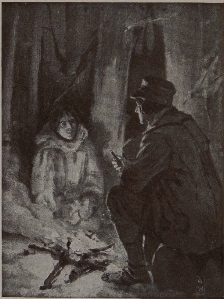
Thom crouched down by her husband's side, motionless as a bronze statue. (p. 15.)